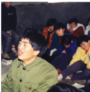
Chinese house church.

Police summoned other key members and staff of a West China house church for questioning. The church has a positive reputation across all of China. Pray that God would loosen these chains.