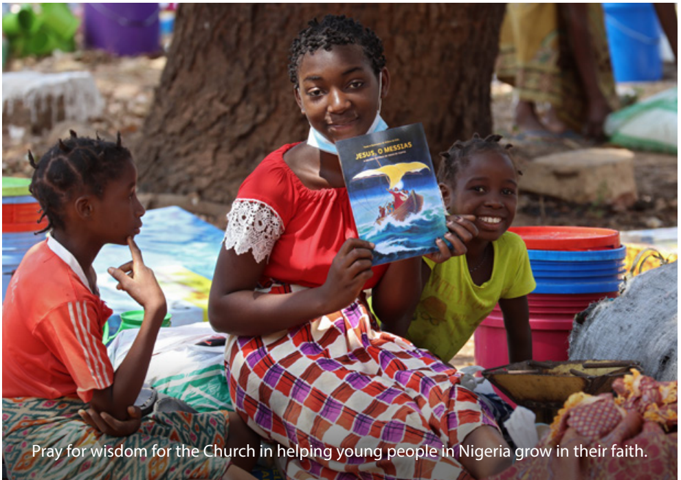
Pray for wisdom for the Church in helping young people in Nigeria grow in their faith.

A Hindu extremist group known as Hindu Siva Sena frequently disrupts Christian events and forcefully shuts them down. Pray that they will repent from these actions.