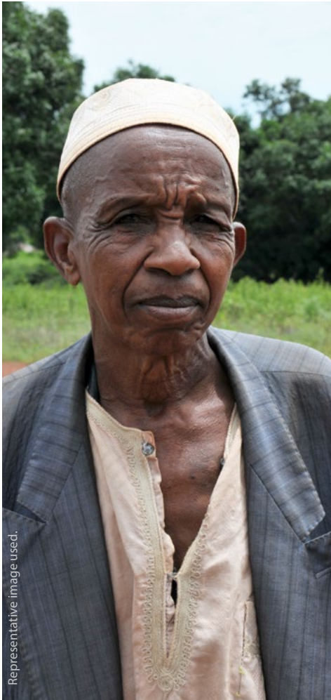
Representative image used.

Pray that the faith of those in the Fulani herdsman community who received Christ as their Saviour will continue to grow and that God will use them among their families to be His witnesses.