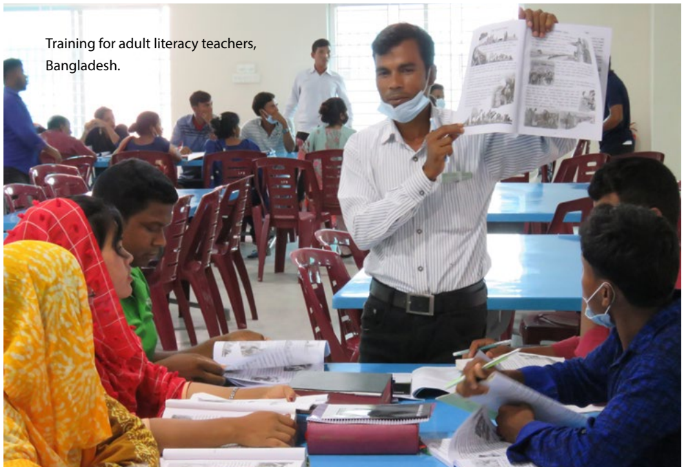
Training for adult literacy teachers, Bangladesh.

Pray for the believers who oversee the training centres, which aim to empower persecuted believers. Pray that courses offered to our persecuted family will be a means of a new chapter and life for them.