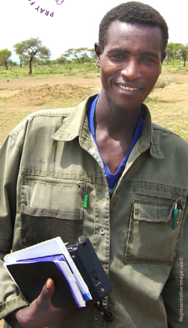
Representative image used.