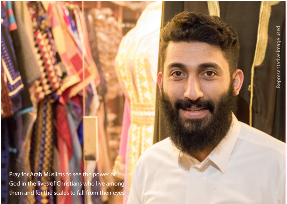
Representative image used.

Arab Muslims long to see the power of Allah in their lives through miracles, healings,