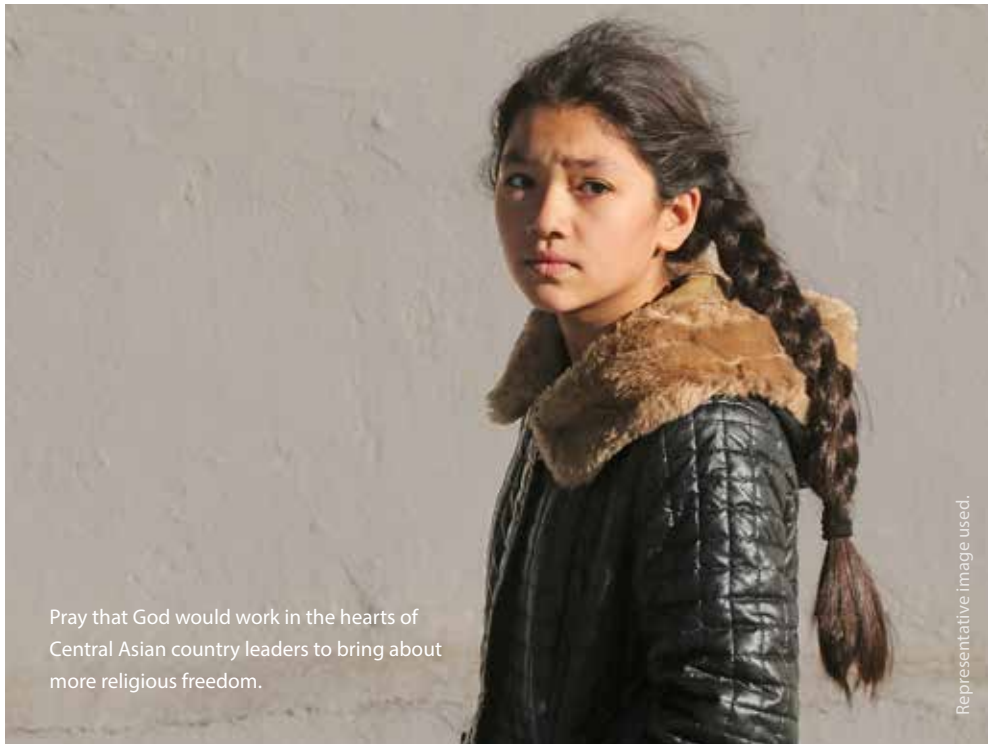
Representative image used.

Pray that God would work in the hearts of Central Asian country leaders to bring about more religious freedom.