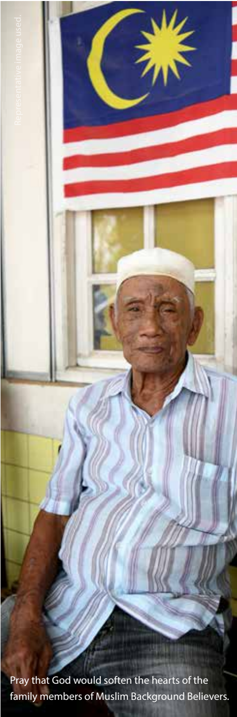
Pray that God would soften the hearts of the family members of Muslim Background Believers.