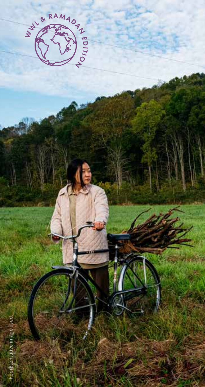
Representative image used.

Lord! Please raise Your eyes and look at Your people. It has been seventy years since the separation. We have done nothing proud in Your eyes, But we are still Your people, marked with a seal. As we have made a vow to live to Your Word, We are all eyes and ears to You now.