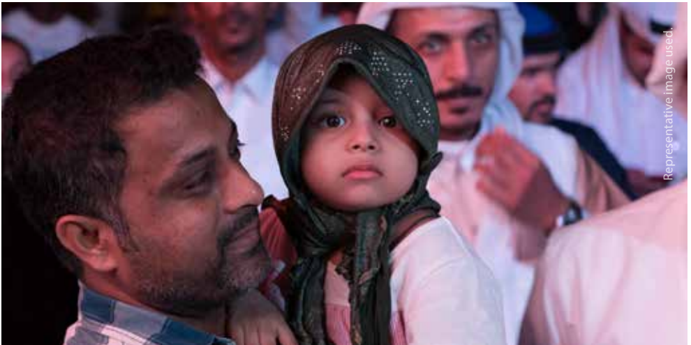
Representative image used.

Christians want to show God's love by respecting Muslims, but they don't want to be forced to do something they don't