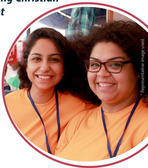
Representative image used.

They target young Christian girls with low self-esteem and groom them by pretending to love them. Thankfully, your