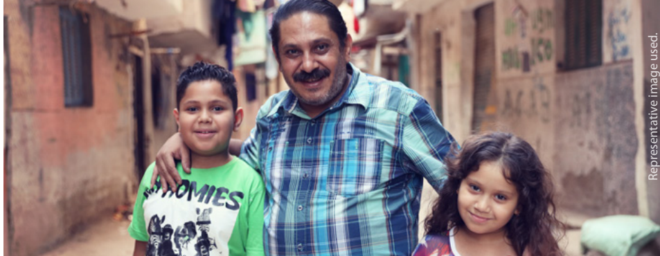
Representative image used.