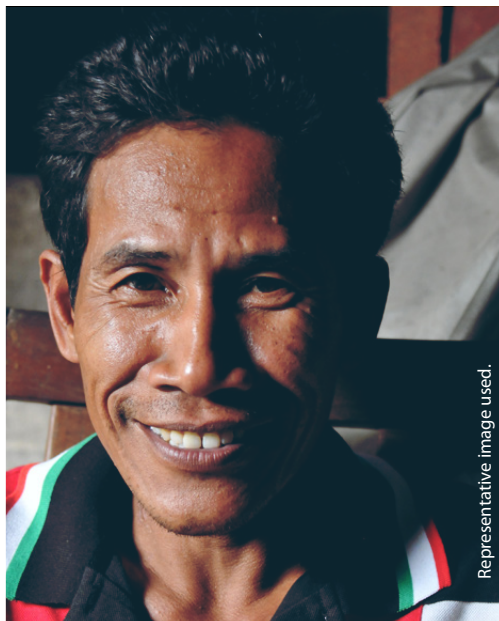
Representative image used.

The members of this group aren't wealthy, so they give their time and energy to bless their community. Being out among their neighbours also provides them with