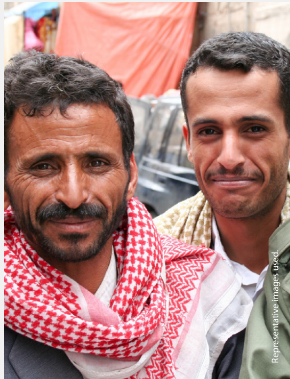
Representative images used.