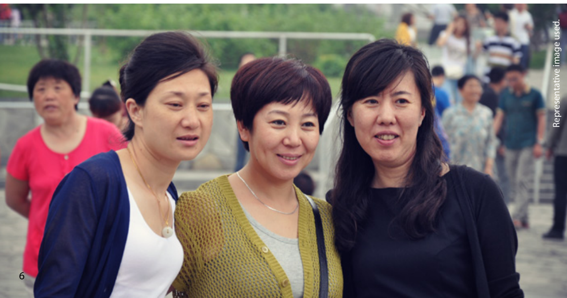
Representative image used.

See pages 7–10 for travel opportunities this year!