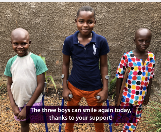
The three boys can smile again today, thanks to your support!

Praise God for helping these three boys forgive those extremists who attacked their church. And thank you for supporting your brave young brothers!