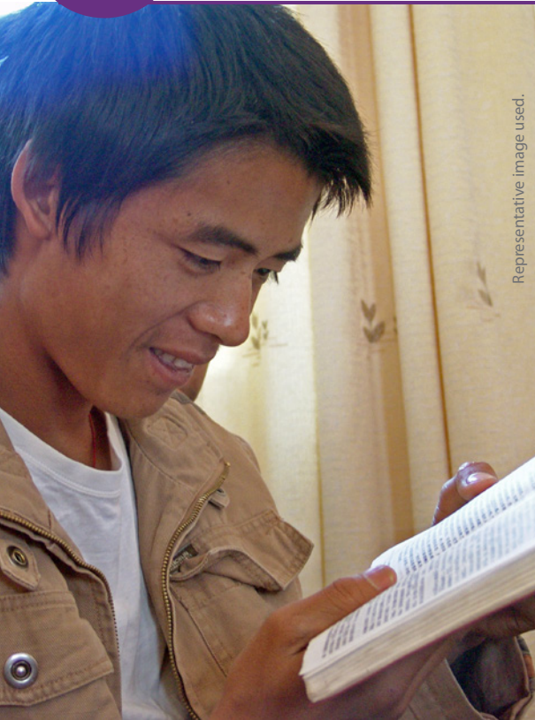
Representative image used.

Your partnership ensured that Bible delivery remained at the very core of Open Doors' ministry in 2018. Because whatever trials believers may face, God's Word brings new strength, true courage and eternal comfort.