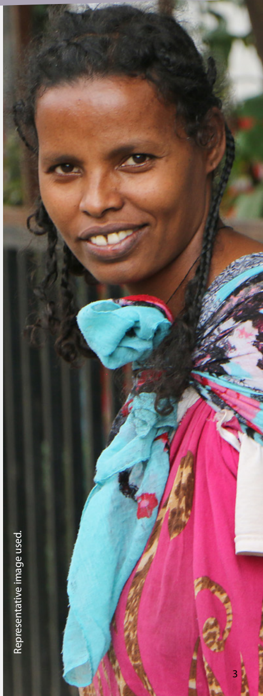
Representative image used.