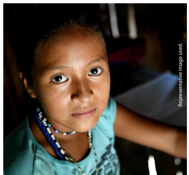
Representative image used.

Writing/Drawing campaign ends 31 December 2019