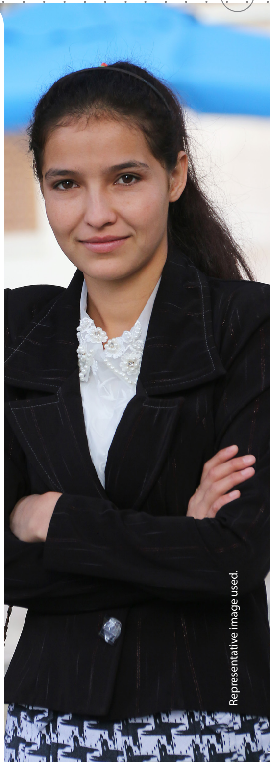
Representative image used.

*Should this project become fully funded, we will apply your gift where the need is greatest.