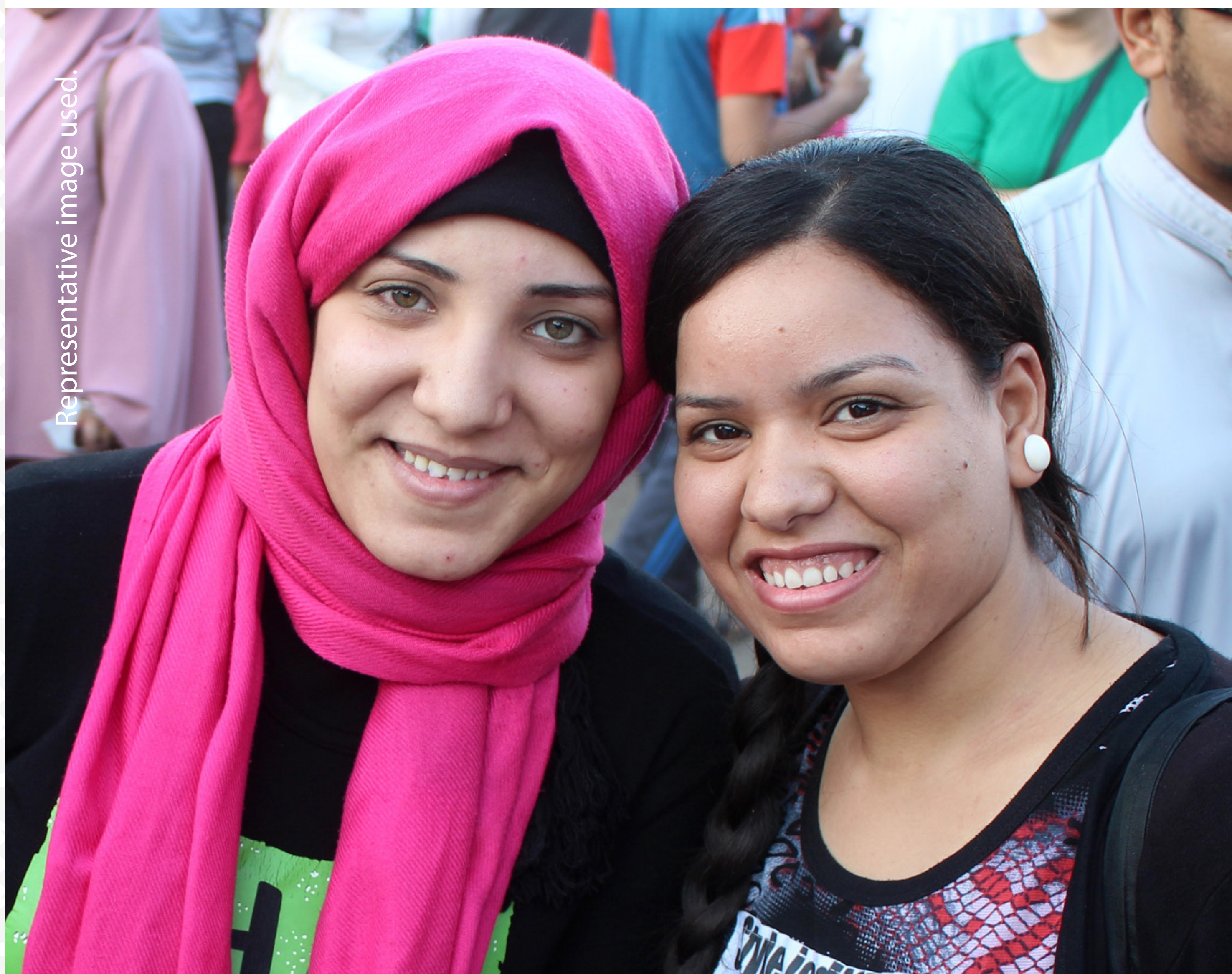
Representative image used.

To truly reach Muslims with the Gospel, we must first understand who they are and what they follow.