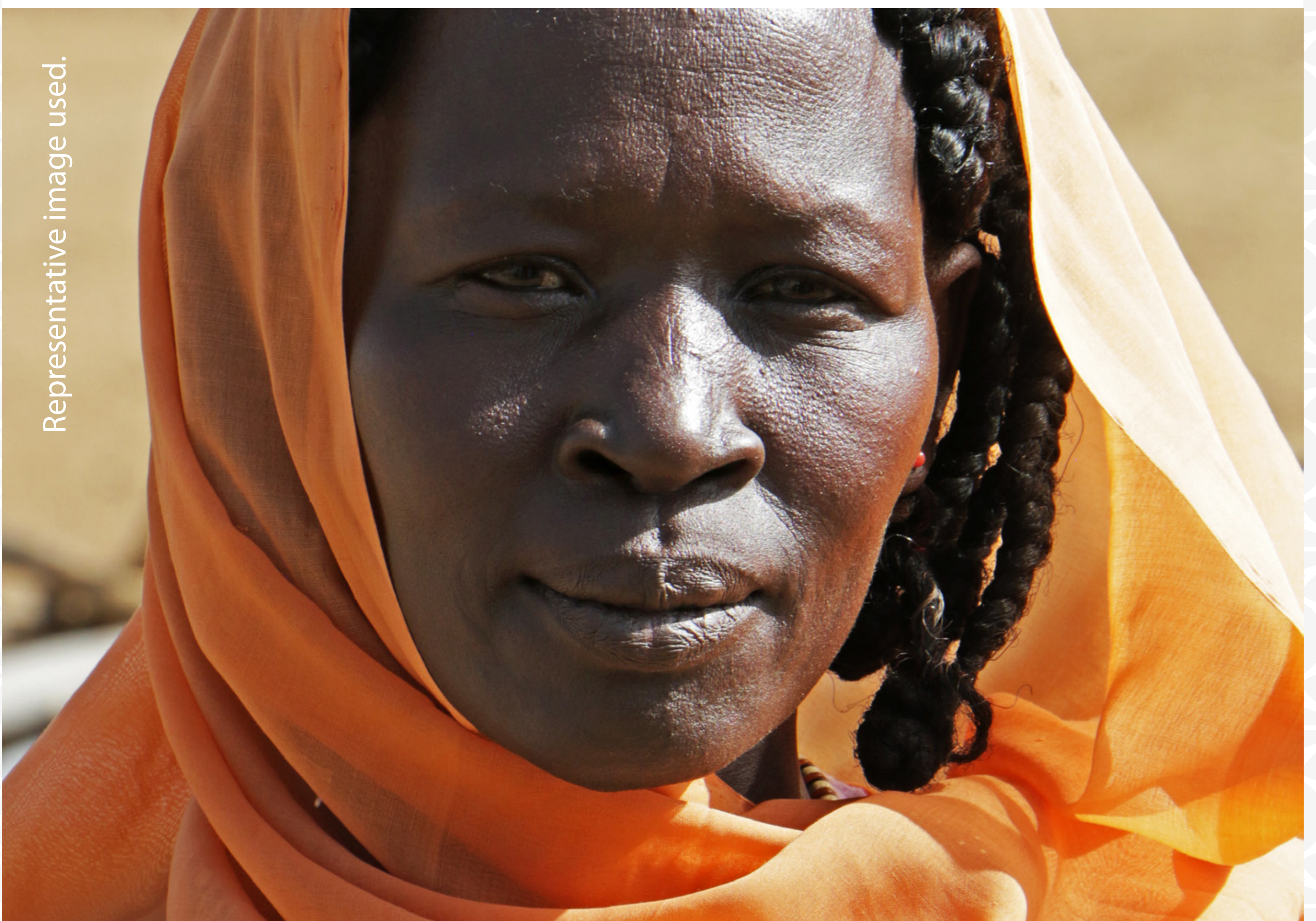
Representative image used.

5 | EID AL-FITR Today, Muslims around the world celebrate Eid to mark the end of their month-long fast. This is a time when Muslims seek forgiveness from one another. Pray that God will open their eyes to see that the way to eternal forgiveness is in Jesus Christ.