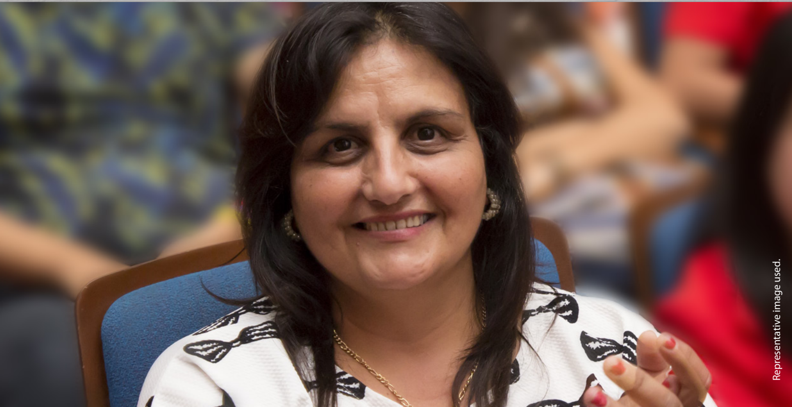
Representative image used.