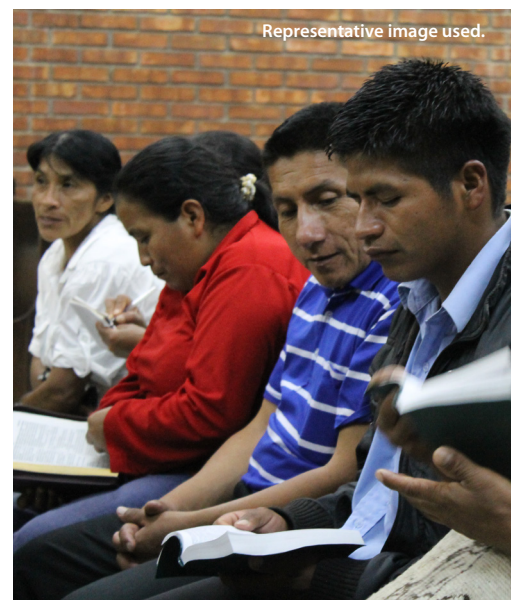
Representative image used.

So, we invite you to send words of encouragement to these pastors and their churches, letting them know that there are believers around the world standing in the gap for them. Pray for the Lord's protection over them and that, despite the increased danger, they will be a bold witness for Christ.