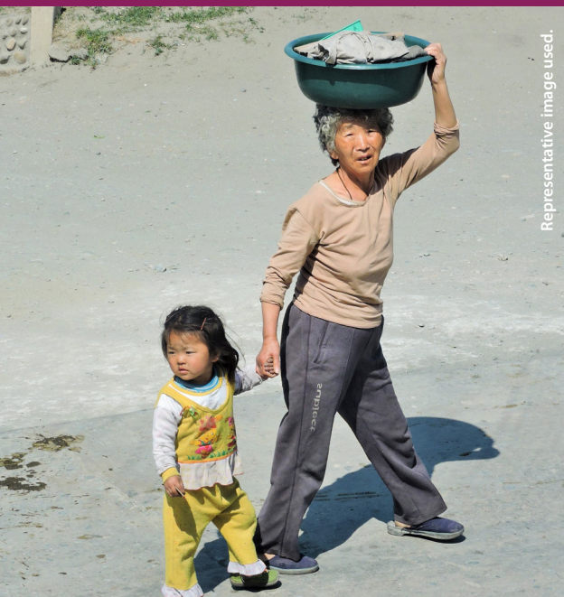
Representative image used.

Although we are still not able to forward letters to believers in North Korea, we do have an exciting opportunity for you to encourage them!