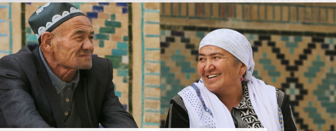
Pray that God will bring many Muslims to church this Ramadan, and that they too will be saved.

27 SOUTHEAST ASIA Muslims who convert to Christianity have a lot of difficulties raising their children as Christians. They are forced to put their children in public schools where they are taught the Qur'an. Pray that during this month of fasting, God will give these children strength and wisdom, as they may face much pressure from their fasting Muslim peers.