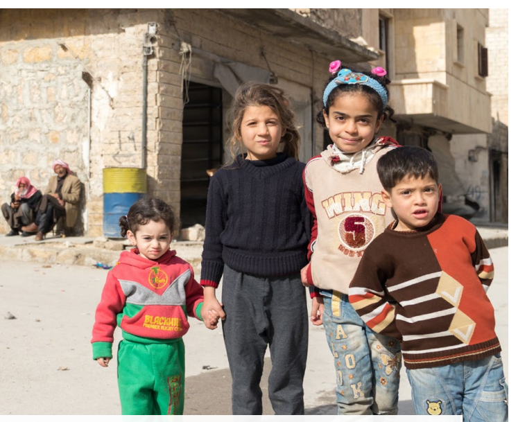
Pray for wisdom for Syrian church leaders, as communities look to them and the Church for guidance.

5 SYRIA In some communities in Syria, the Church is the only authority structure still left. Pray for wisdom for church leaders, as communities look to them and the Church for guidance.