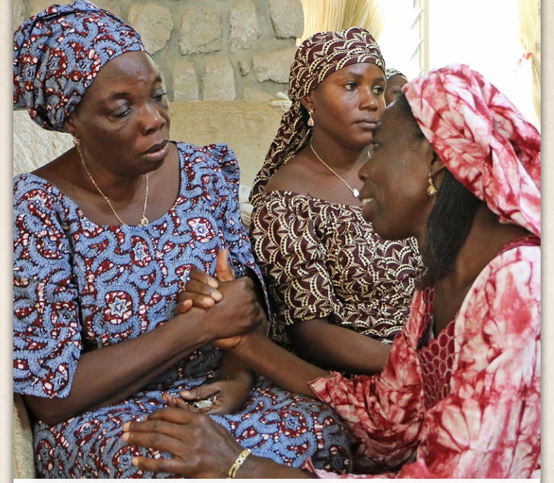
Pray for God's comfort for the many widows in Nigeria who have lost their husbands at the hands of Muslim extremists.

9 Please pray for Mauritania – a self-proclaimed Islamic Republic, which has been under military rule for three decades. There are very few Christians living in this country and they feel very